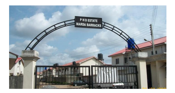
Figure 1: Gated Communities on Lagos Mainland