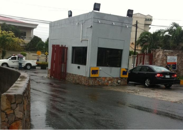
Figure 2: Gated Communities in Lekki area

The transcribed qualitative data were subjected to content analysis. Some typical questions were: To what extent do you feel emotionally attached to this residential estate? What unique feature or character of the estate do you feel attached to? How secure do you feel in this estate relative to the outside? To what extent do the security measures provided affect your feelings of attachment to this place? How has your feeling of attachment changed with time?