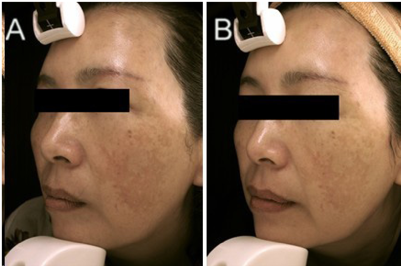
Figure 3: Clinical photograph of case 2 at the baseline (A) and after 6 months follow-up (B)